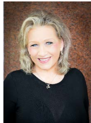
Beth Stafford Award of Excellence