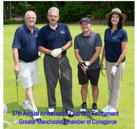
37th Annual Ambassador Club Golf Tournament Greater Manchester Chamber of Commerce