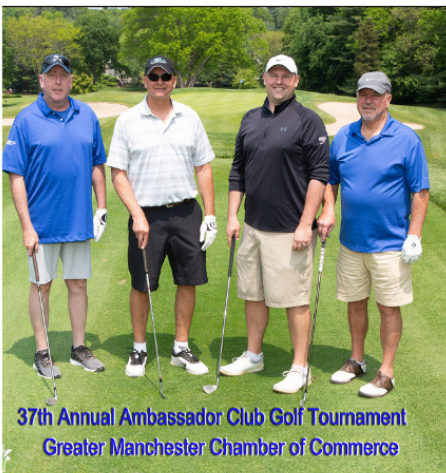
37th Annual Ambassador Club Golf Tournament Greater Manchester Chamber of Commerce