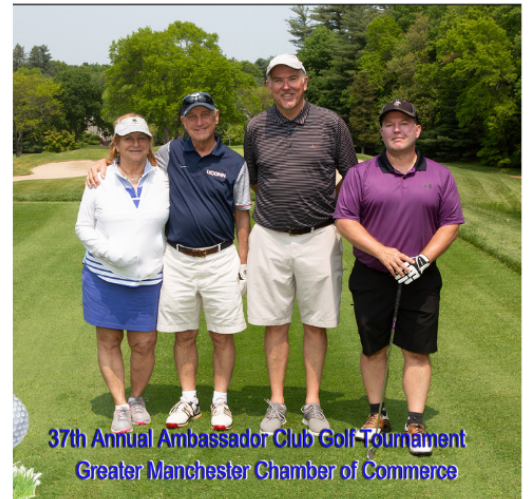
37th Annual Ambassador Club Golf Tournament Greater Manchester Chamber of Commerce