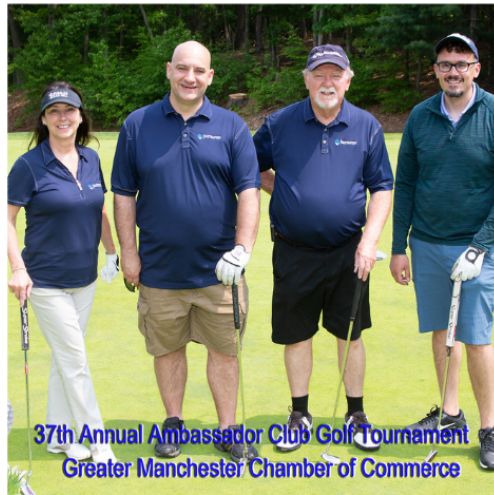
37th Annual Ambassador Club Golf Tournament Greater Manchester Chamber of Commerce