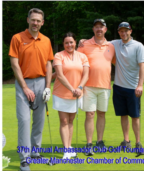
37th Annual Ambassador Club Golf Tournament Greater Manchester Chamber of Commerce