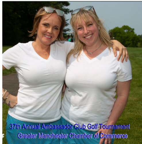
37th Annual Ambassador Club Golf Tournament Greater Manchester Chamber of Commerce